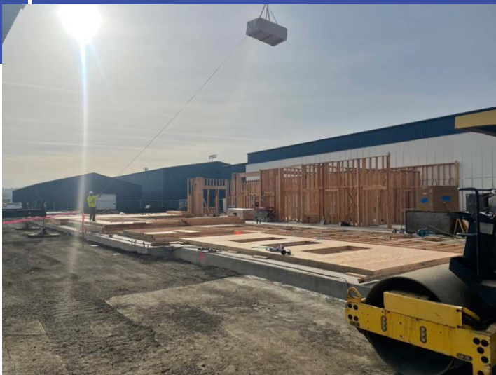
Framing in progress at the new middle school addition.

Advancement of the construction for the Amity School District Bond Program in April included many visual indicators for the progress occurring onsite. Most notably, the vertical framing began at both the new classroom addition and the high school gym, giving shape to the future facilities.