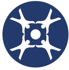
EXHIBIT I OWNER ACCESS STANDARDS

Contractors working on, in and/or around any properties owned by District shall comply maintain and/or provide the information as described in the Work Agreement. Failure to comply with this agreement could be grounds for termination if the District so Chooses.