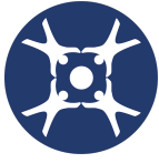
EXHIBIT B INSURANCE REQUIREMENTS

Contractor will at all times specified herein, and prior to any entry onto the job site, provide and maintain for itself and require the Subcontractors to provide and maintain the following types and the following minimum limits of insurance written on an occurrence basis by a company or companies rated A/IX or better in the most recent edition of "Best's Insurance Guide" (or such lesser rating as may be approved by Owner in writing) and authorized to do business in the state where the Project is located. Continued compliance with these requirements is a condition precedent to payment.