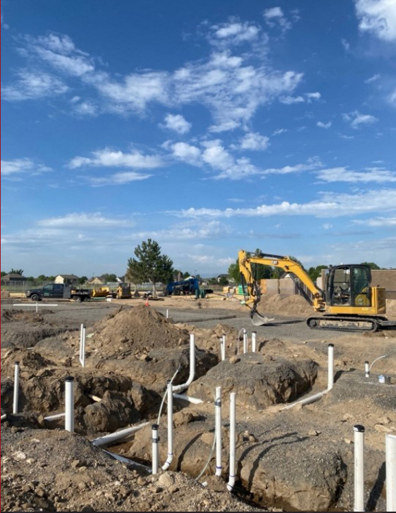
Plumbing utility stub ups getting installed and filled over.