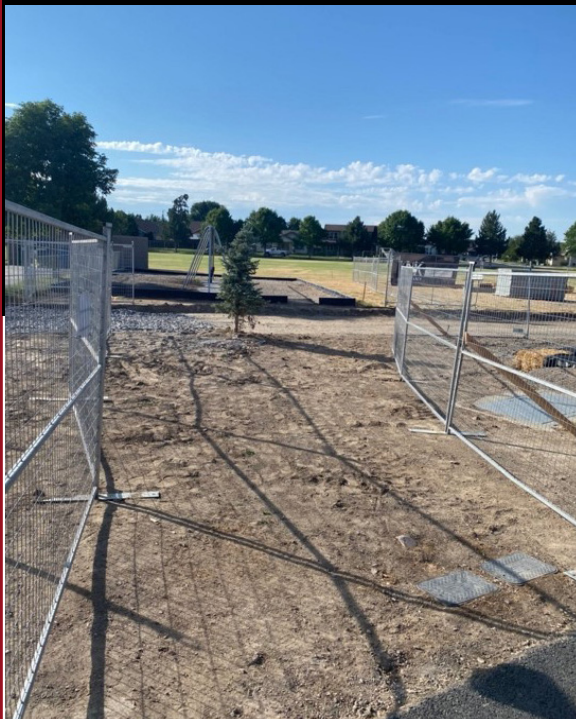
Fencing in place for Tom McCall students to access the field and footing casing being installed in preparation for concrete to be poured.

The first week of September will be spent finishing any exterior work that will affect the start of the school year. All the concrete, landscaping, and jobsite clean-up will be completed before September 6th. Following the push for the start of the school year, work will be focused on getting the pad of the addition completed. Once the pad is poured, framework will begin.