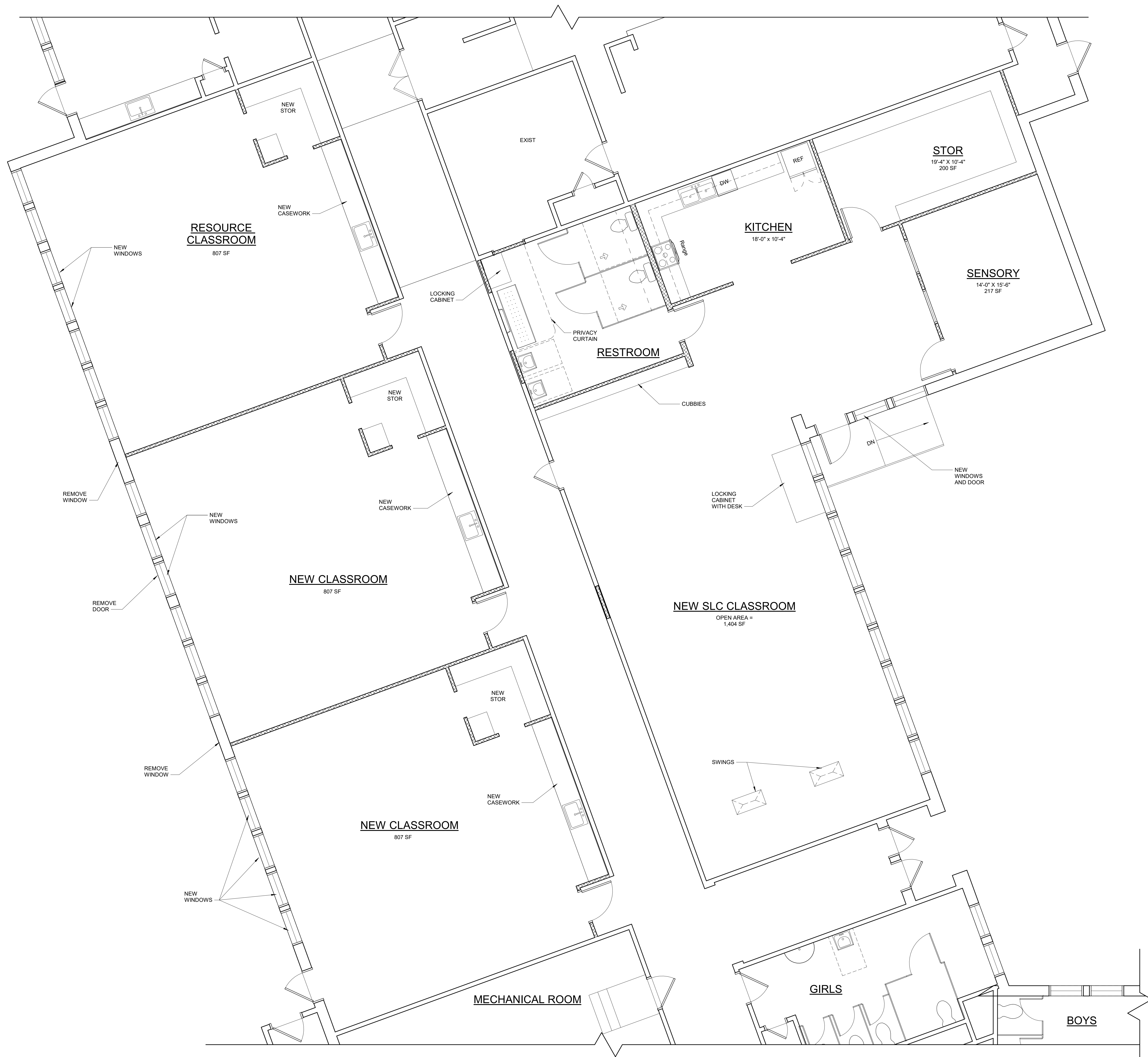
PARTIAL FLOOR PLAN - OPTION 3 1/4" = 1'-0"

EXIST SLC OPEN AREA = 1,725 SF EXIST SENSORY = 200 SF EXIST STORAGE = 287 SF TOTAL AFFECTED AREA = 4,067 SF