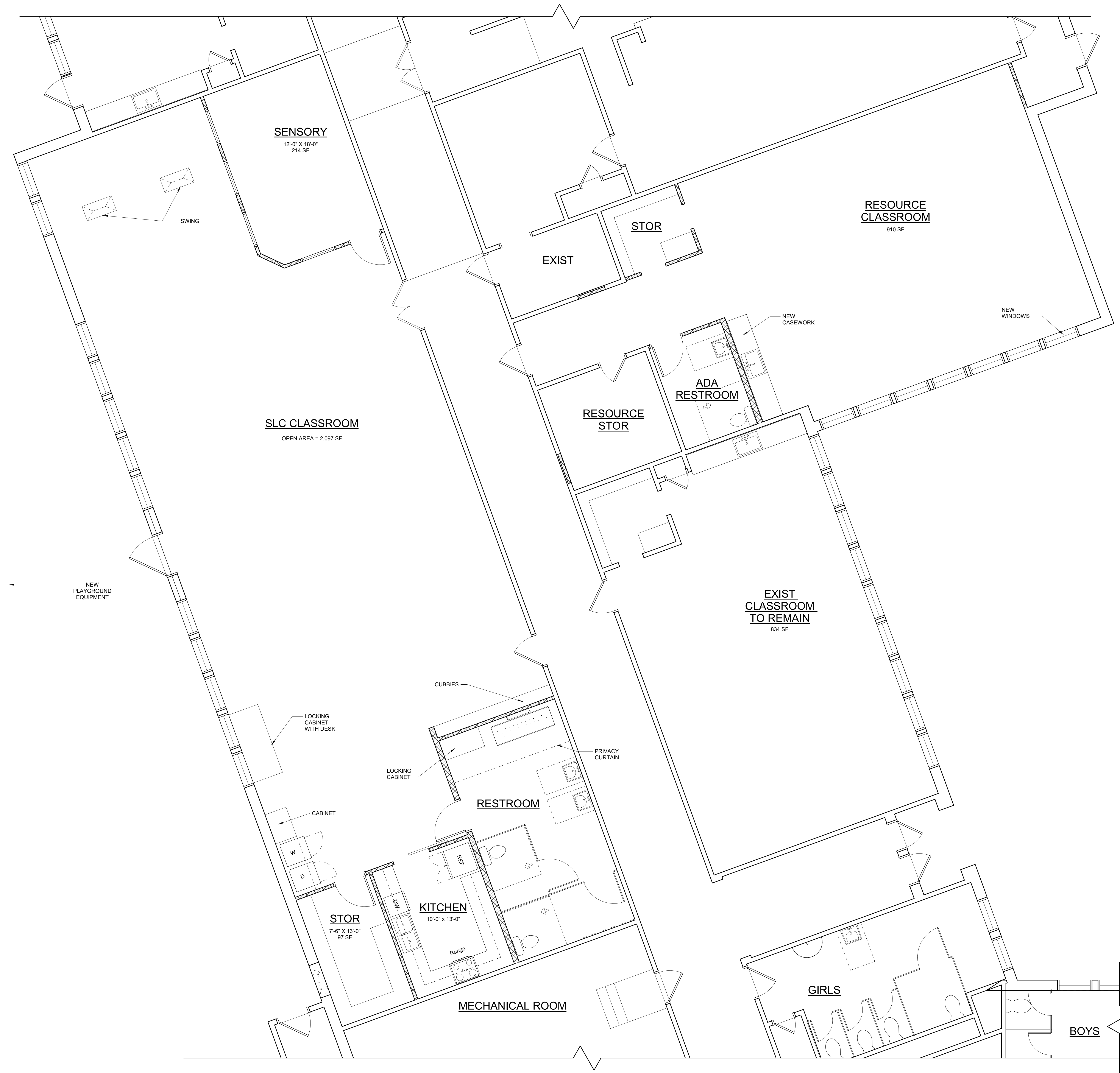
PARTIAL FLOOR PLAN - OPTION 2 1/4" = 1'-0"

EXIST SLC OPEN AREA = 1,725 SF EXIST SENSORY = 290 SF EXIST STORAGE = 267 SF